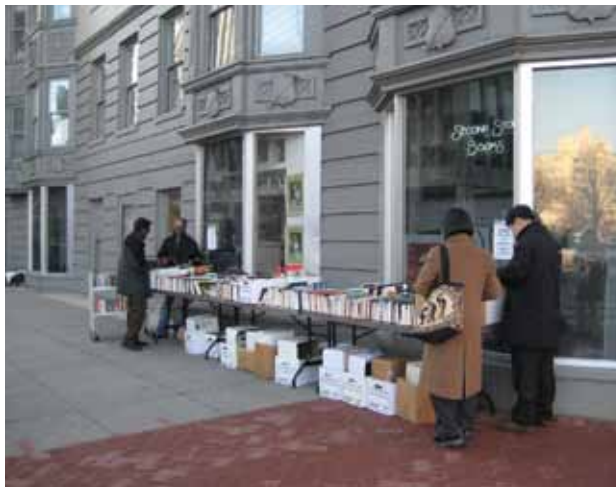
Open-air bookselling at Second Story's Dupont Circle location.

When did you become aware that the DC bookselling business had begun to change? What signs did you