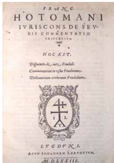
Title page with vignette from Hotman's De Feudis Commentatio Tripertita .

De Thou began building his collection in 1573. At his death, it contained about 9,000 works in nearly 6,000 volumes. 4 Jacques-Auguste acquired his books through the usual routes: purchase, gift, and bequest. He inherited the collection of his father, the distinguished jurist and Premier Président of the Paris Parlement Christophe de Thou (1508-1582), who led the redaction effort for the 1580 Coutumes de Paris . Among the many leading intel-