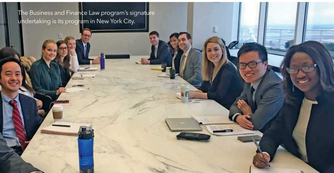
The Business and Finance Law program's signature undertaking is its program in New York City.