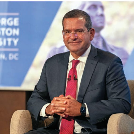
Gov. Pedro Pierluisi

Rep. Wild and her son also discussed the lawmaker’s role as an advocate for mental health following her partner’s death by suicide in 2019 and her experience in the Capitol during the Jan. 6 attacks. She co-sponsored a bill calling for a memorial education exhibit about the attack.